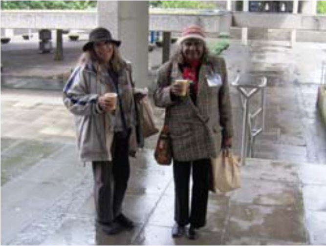
The "two mums", Australian indigenous participants.