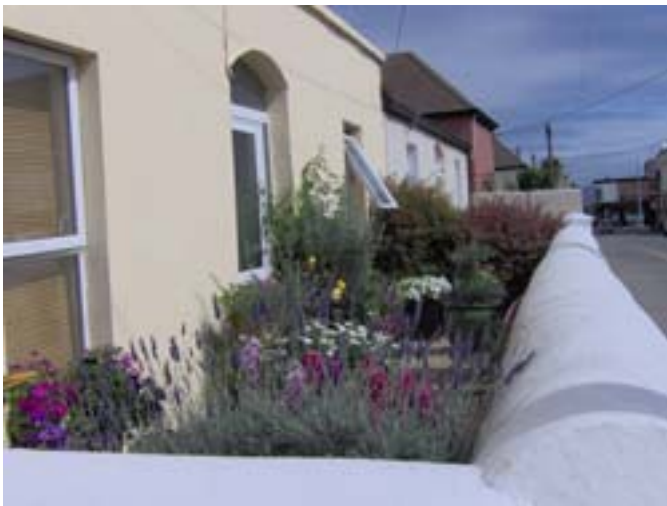
Flower garden, Glathule neighborhood.