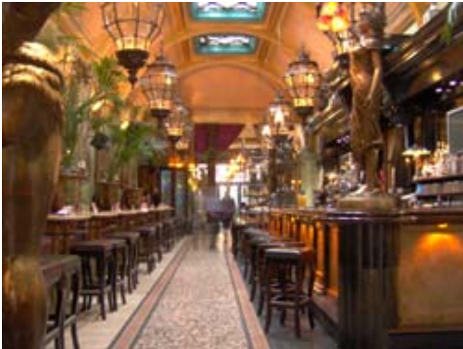
Downtown Dublin.