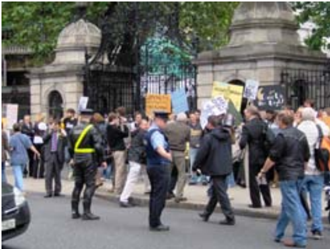
Protesting EU Lisbon Treaty next to National Museum.