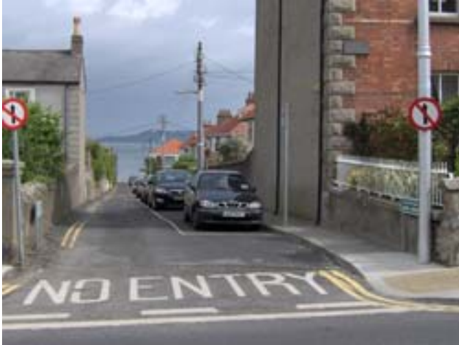
View through Glasthule neighborhood to Sandy Cove.