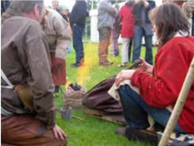
Pumping bellows on the fire preparing for bronze casting, final party.