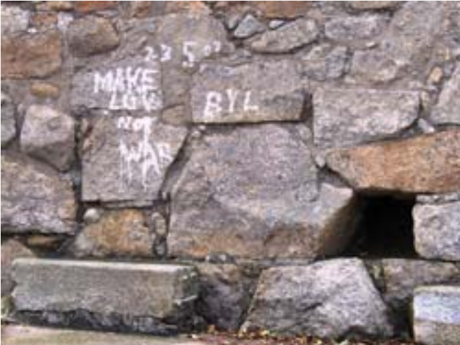
Stone Wall, "Make Love, Not War".