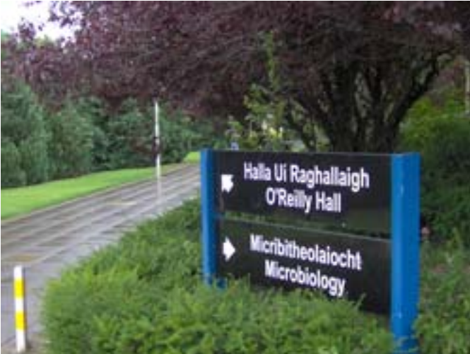
Bilingual signs in Gaelic and English are found everywhere.