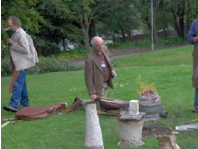
WAC Fringe neolithic bronze casting demonstration.