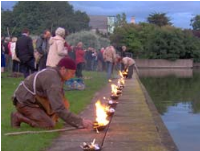
Lighting ceremonial fires for Red Earth Ceremony, final party.