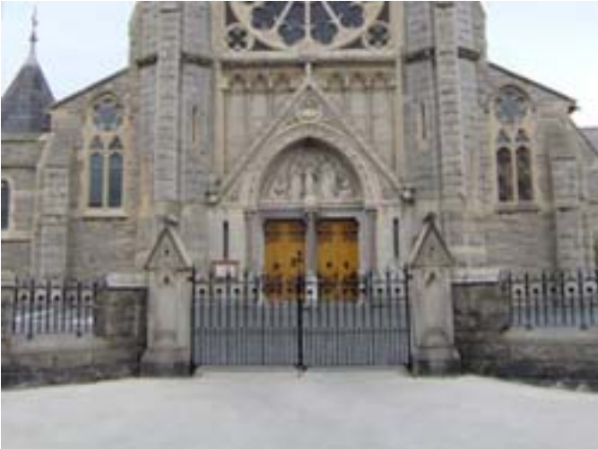
Stone Church, Glasthule.