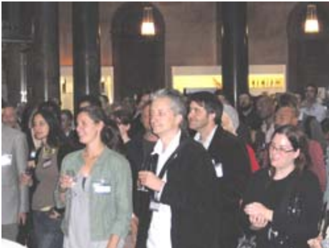
National Museum reception.