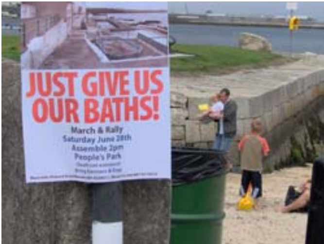
Poster protesting development of water front at Sandy Cove, "Just Give Us Our Baths.

Thursday, 12 June 2008 00:00 - Last Updated Tuesday, 19 May 2009 11:27