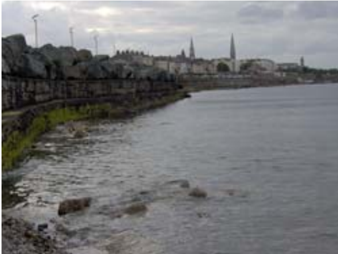
View across Sandy Cove to Dun Laoghaire.