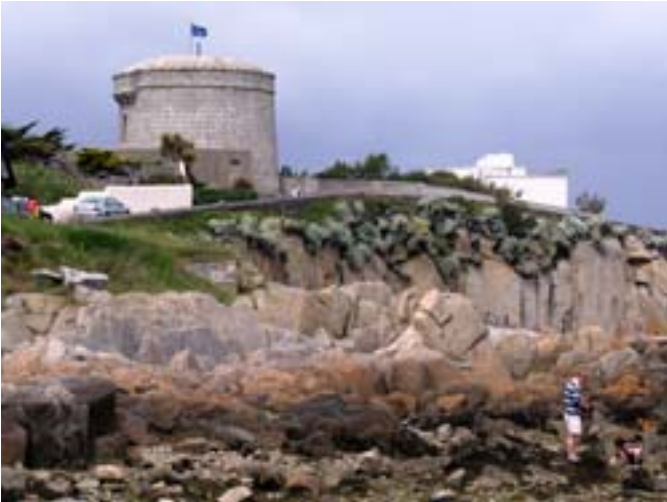
Martallor Tower, known as James Joyce Tower because he lived there with other artists and wrote of wa

Thursday, 12 June 2008 00:00 - Last Updated Tuesday, 19 May 2009 11:27