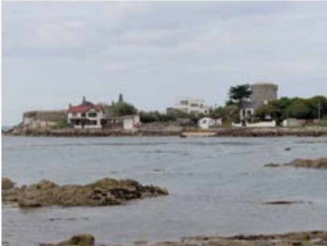
View across Sandy Cove to James Joyce Tower.