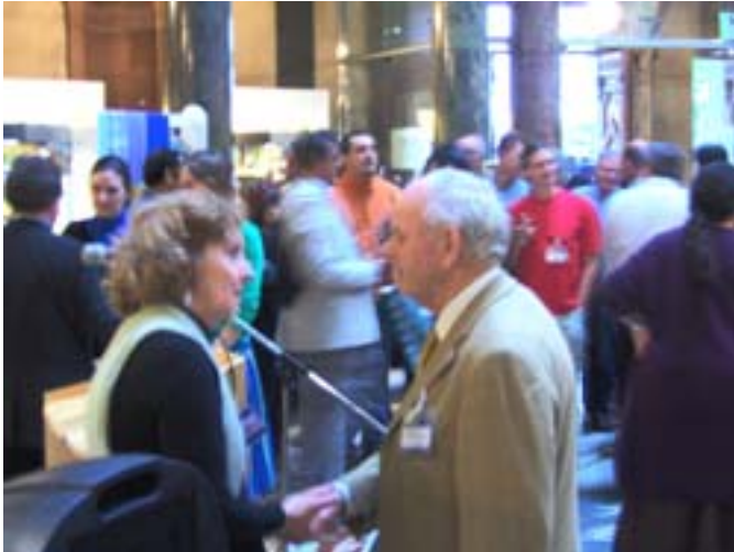
National Museum reception.