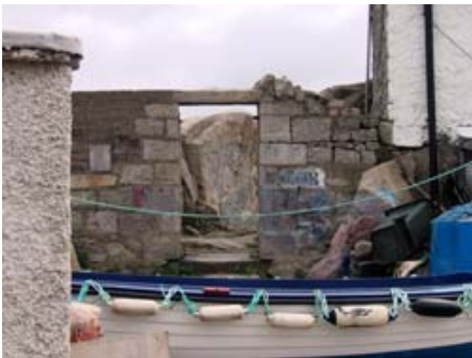
Old Irish Fisherman, Wooden Boat, Stone Wall.