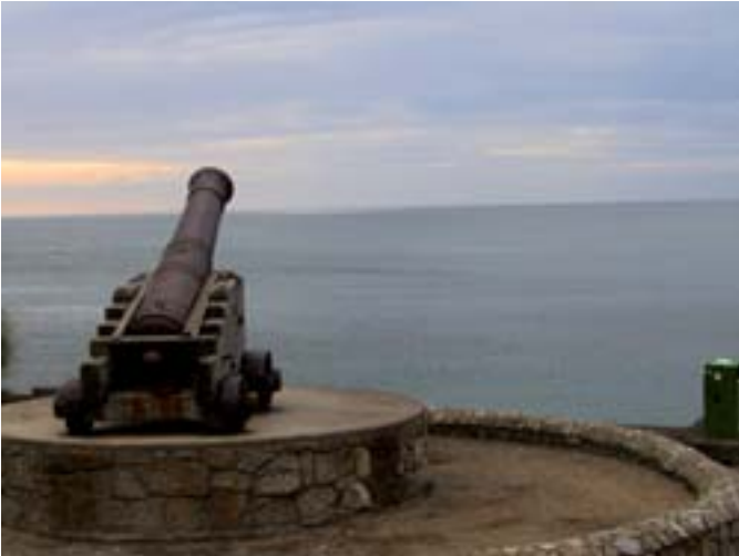
A Loose Cannon and a spot of light on the sea.

Thursday, 12 June 2008 00:00 - Last Updated Tuesday, 19 May 2009 11:27