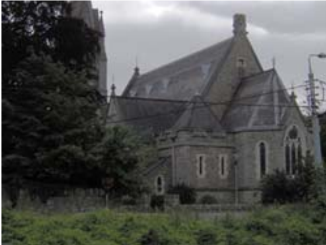
Stone Church, Dun Laoghaire.