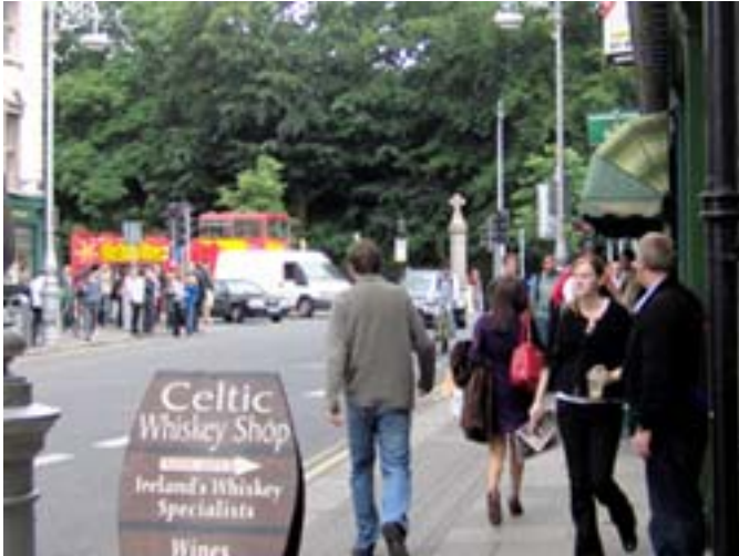
Downtown Dublin.

Thursday, 12 June 2008 00:00 - Last Updated Tuesday, 19 May 2009 11:27