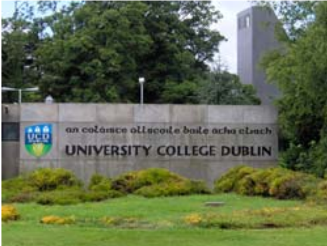
University of College Dublin, bi-lingual entrance sign, Gaelic and English.