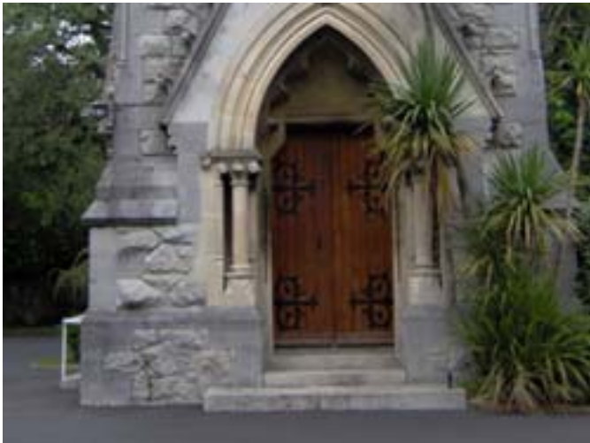
Church Entrance, Dun Laoghaire.